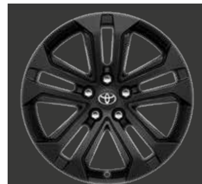
18" matt black machined-face alloy wheels (5-double-spoke) Optional on all grades