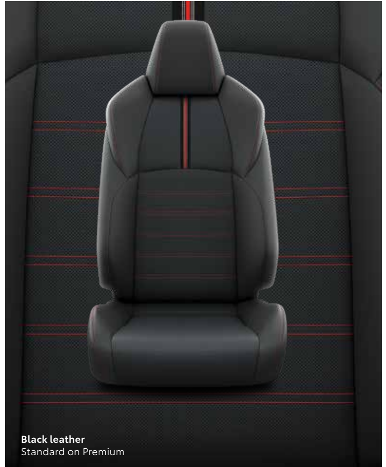
Black leather Standard on Premium