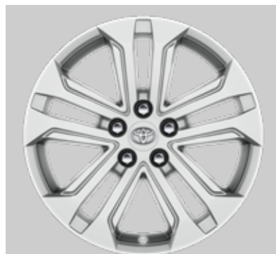
18" silver machined-face alloy wheels (5-double-spoke) Optional on all grades