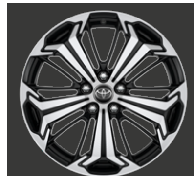
19" black machined-face alloy wheels (5-spoke) Standard on Premium