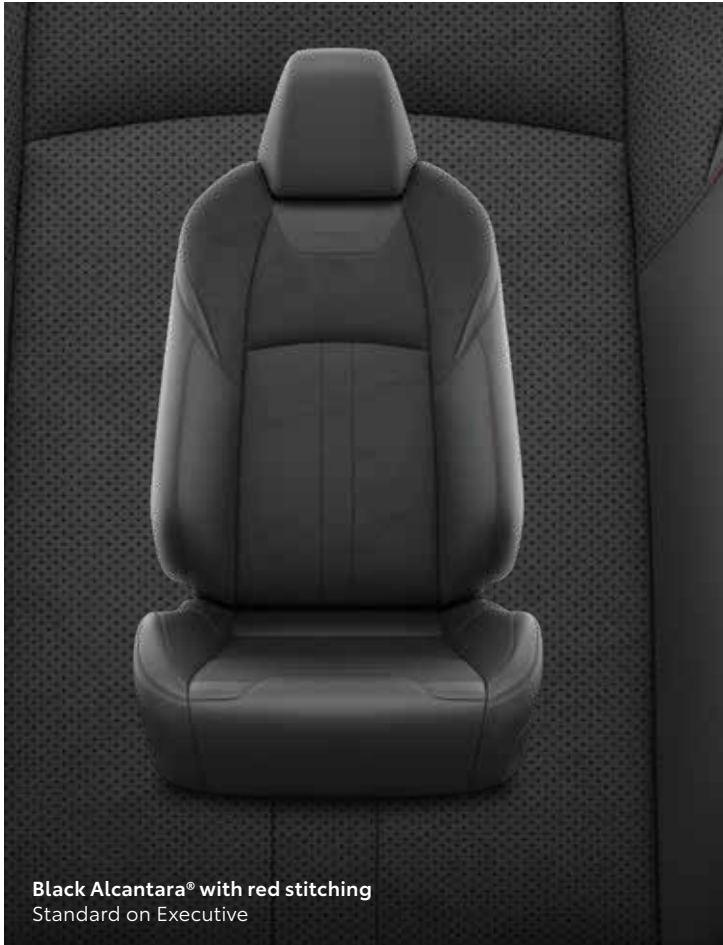
Black Alcantara® with red stitching Standard on Executive