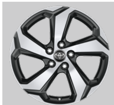
18" grey machined-face alloy wheels (5-spoke) Standard on Executive

Complete your look with a choice of head-turning 18" or 19" machined-face alloy wheels. Inside the new RAV4 Plug-in Hybrid, black trim options range from Alcantara® to genuine leather with contrasting red stitching, to add an extra touch of sportiness.