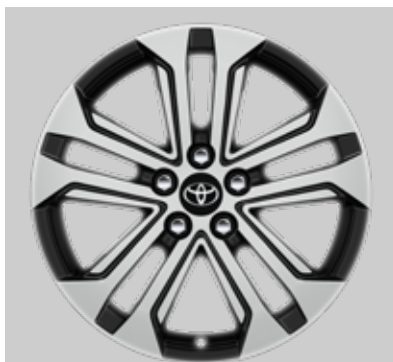
18" machined-face alloy wheels (5-double-spoke) Optional on all grades