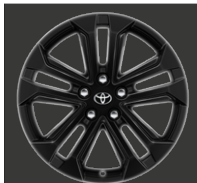
18" glossy black machined-face alloy wheels (5-double-spoke) Optional on all grades